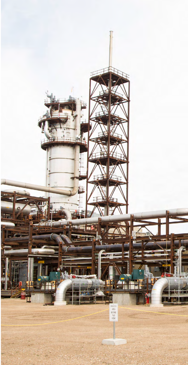
Quest carbon capture and storage facility at the Scotford Upgrader

Developing a robust clean hydrogen economy can unlock significant economic value for Alberta and Canada, while advancing critical environmental outcomes. Deploying hydrogen into the transportation and home-heating sectors, and incorporating it as fuel for electricity generation and other industrial processes, is key to Canada's ability to meet GHG reduction targets under the Paris Accord. Growing demand for hydrogen provides Alberta with a new strategic opportunity to expand and integrate its natural gas value chain. This will benefit Albertans, Canadians and the world by creating jobs, generating government revenue and contributing clean fuel to the global economy.